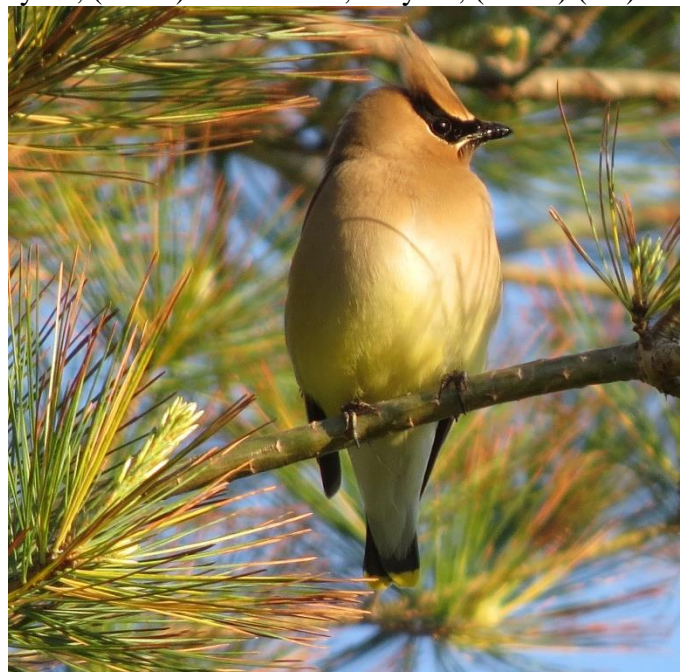
Cedar Waxwing