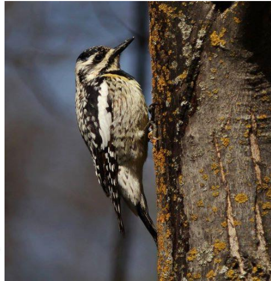
Black-crowned variant of the Yellow-bellied Sapsucker