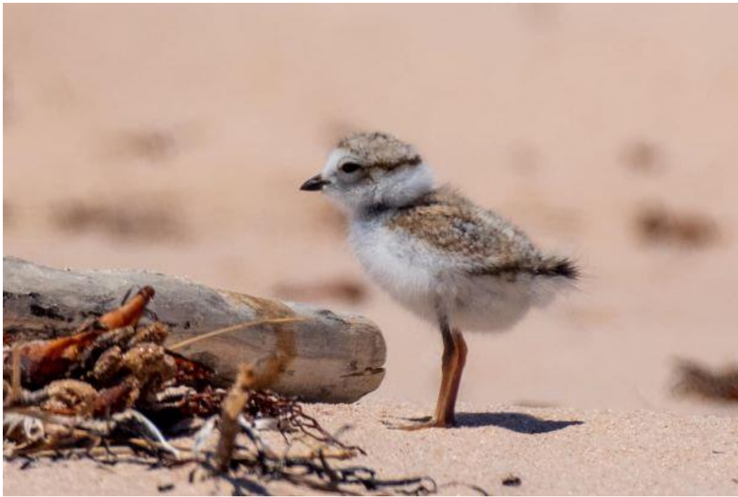
Piping Plover Chick

April 25, (JFJ); 4 at East Point, April 29, (SCS); 3 at Borden, May 1, (MAM); 3 at Summerside, May 5,