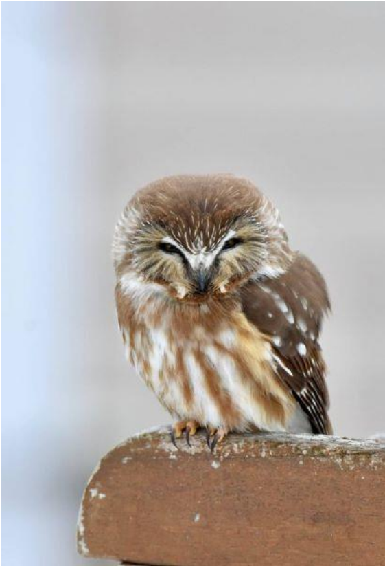
Saw-whet Owl

Hillsborough Walking trails, April 20, (MAM); 6 at Little Harbour Beach, May 15, (RP); 28 at Gulf Shore Pky, May 24, (MAM); Lesser Scaup -1 at Borden, May 8, (DRM); Common Eider -20 at Mount Carmel, Mar 31, (JFJ);; 260 at East Point, April 29, (SCS); 200 at East Point, May 14, (RP); 9 at East Point, May 16, (SCS); 75 at East Point, June 5, (JDM)DRM) Harlequin Duck -4 at East Point, May 14, (RP); 9 at North Cape, May 27 (DRM) ; Surf Scoter -18 at Borden, May1, (MAM); 1 at East Point, June 5, (JDM) DRM) ; 8 at Murray River, June 2, (TB); White-winged Scoter -1 at East Point, June 5, (JDM)DRM) ; 3 at Cabot Park, April 21, (DRM); 5 at Mount Carmel, April 25, (JFJ); 1 at East Point, April 29, (SCS); Black Scoter - 20 at Mount Carmel, Mar 31, (JFJ); 41 at Borden, May1, (MAM);; 17 at Cabot Park, April 21, (DRM); 125 at East Point, April 29, (SCS); 6 at Summerside, May 5, (DRM);50 at East Point, May 14, (RP); 50 at East Point, June5,(JDM)DRM); Long-tailed Duck -10 At Mount Carmel, Mar 31, (JFJ) ; 6 at Borden, May 8, (DRM); 3 at East Point, May 16, (SCS); Bufflehead -2 at Pownal, May 10,(RP) ; Common Goldeneye -6 at Hillsborough Walking Trail, April 20, (MAM) ; Barrow's Goldeneye -3 ; 4 at Tryon, April 29, (RA); Hooded Merganser -3 at Borden, May 21,(DRM) ; Common Merganser -90 at MT Stewart, Mar 23, (GR) ;2 at Mount Carmel, Mar 31, (JFJ); 5 at Rustico, May 10, (MSA);