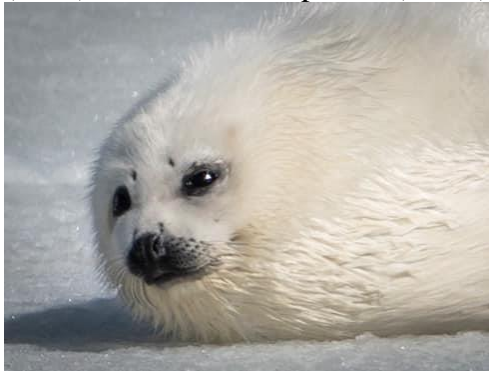
Harp Seal Pup By: Roberta Palmer

MAMMALS: 1 Beluga Whale; Mt Stewart May 11, (JDM) May 13, (DO) May 14, (BAM); 2 Beluga whales, Colville Bay, Souris, May 11 (SAB); American Mink, Summerville, March 26, (RWH) Eastern Chipmunk (FOY) Summerville, April 1, (RWH); Canadian Beaver, Mt Albion, April 18, (RWH); Weasel sp: , Summerside, April 29,( DD); American Mink, Crapaud, May 24,(DD); Harp Seal pup, Souris, March 21, 2021(DRM): Red Fox with 7 kits, Crapaud, May 11, (DD) Muskrat, Cherry Hill, May 11(BAM); 1 Raccoon , Stratford, June 8, (DO)