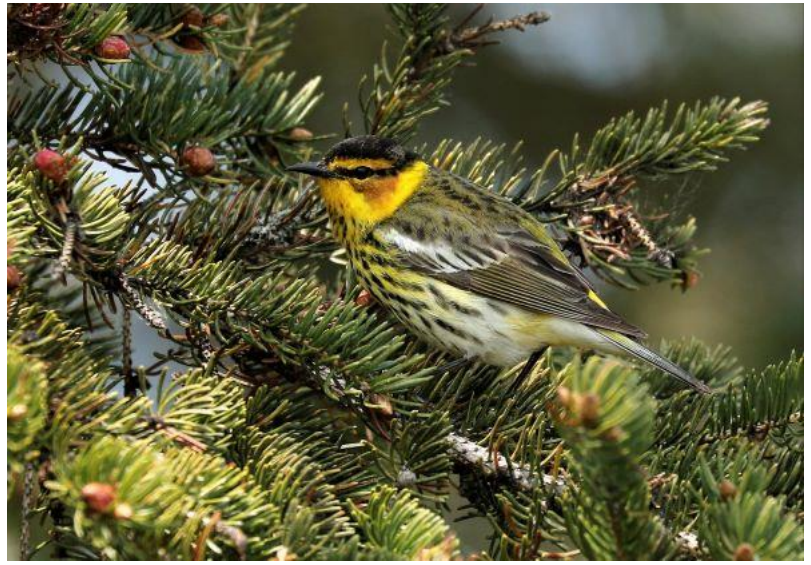
Cape May Warbler