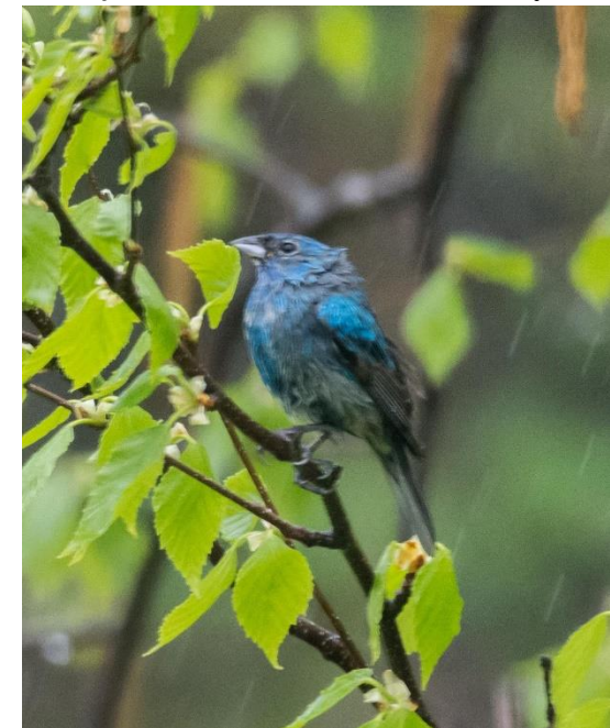
Indigo Bunting Bonnyman