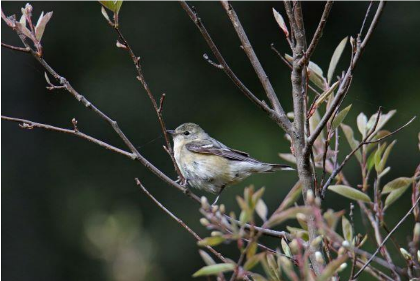
Bay-breasted Warbler (F)