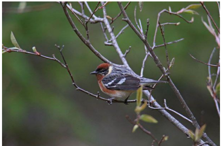
Bay-breasted Warbler (M)

Owling playback conditions were essentially ideal with virtually no wind. The moon was mostly full but obscured in part by light clouds. During the day, it was partly cloudy and later sunny, with temperatures from 1 to 12°C. Just before dawn, light wind commenced, and by mid-day, the wind had come up to 15 km/hr from the northwest to northeast and then again dropped to negligible