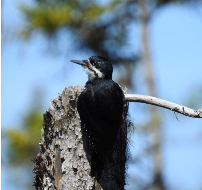
Black-backed Woodpecker (F)

Carmel, April 25, (JFJ); 1 at Abram's Village, May 29, (JFJ); Red-bellied Woodpecker -1 at Montague, April 6, (DMur) ; Yellow-bellied Sapsucker -2 at St Charles Road, May 10, 2021(JGM) ; 1 at Cabot Park, April 21, (DRM); 1 at Mount Carmel, April 25, (JFJ); 5 at Summerside, May 5, (DRM); 6 at North Wiltshire, May 11, (JK); Downy Woodpecker -1 at Summerside, March 21, (SRa) ; 1 at Georgetown, Mar 29, (SCS); 1