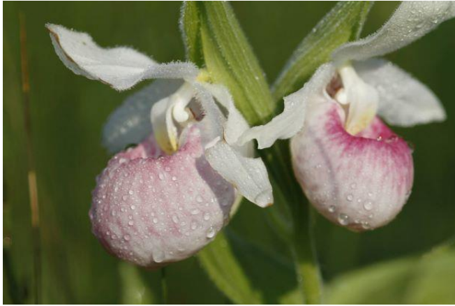
Showy Lady's Slippers

PLANTS: Mayflowers, Georgetown, April 16, 2021 (RWH); FOY Dandelion, Ch'town, April 26, 2021( WFB &EM)White Violets, Donagh, May 5, 2021(JDM); Marsh Marigold, Orwell, May 7, 2021(WFB & EM); Pin