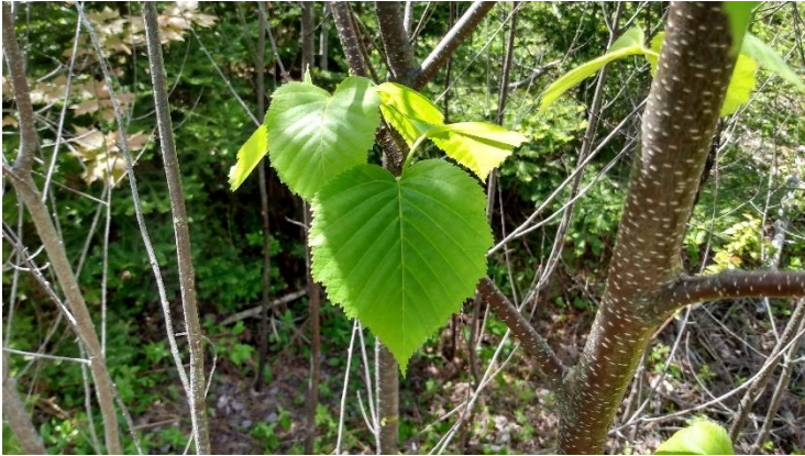
Heart Leaved Birch