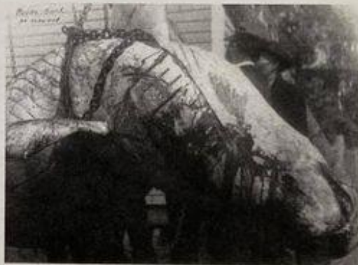
The very rare Beluga whale shot in the Hillsborough River in 1941.