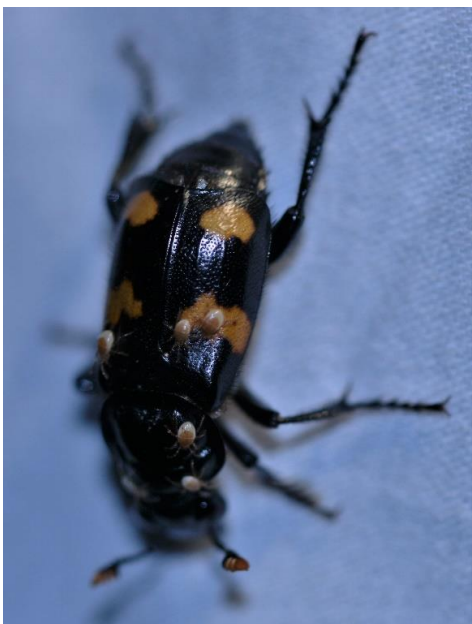
Silphid with several mites