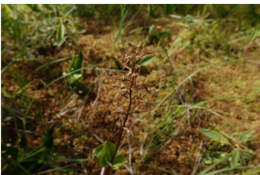
Southern Twayblade ( Neottia bifolia )