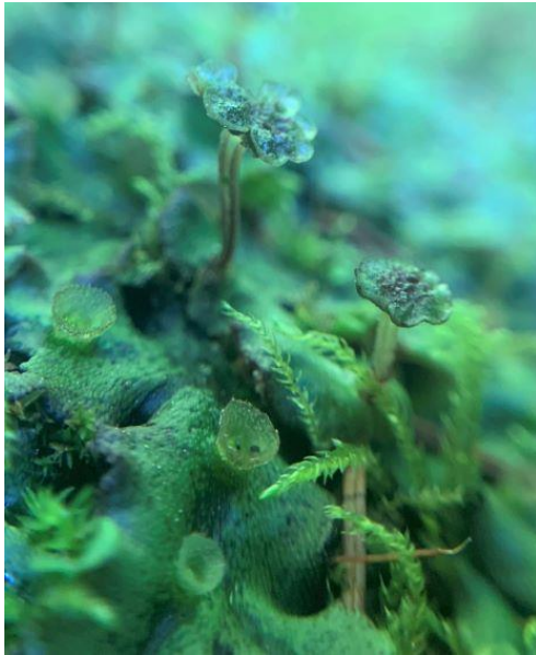
Green-Tongue Liverwort

PLANTS Red Osier Dogwood, Johnston's River, June 11, 2021(JDM) Ox-eye Daisy, Bunbury, June 11, 2021(JDM); Labrador Tea, Miscouche, June 14, 2021(DRM) Blue Flag Iris, Alternate Leaf Dogwood flowering, Donagh, June 15, 2021(JDM) Flowers in Bloom, July 14, Thyme, Daisy Fleabane, Chicory ( both blue and white form)Spirea, Purple Loosestrife, Joe Pye Weed, Pond Lily, common Elder(JDM)(DRM); Green Tongue Liverwortat Monticello, June 18(RWH);