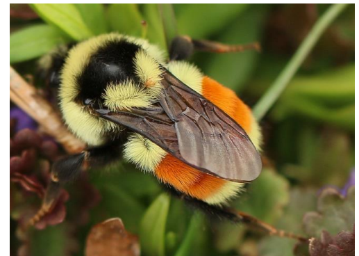
Single Mite on Bombus ternarius

As noted above, the interactions between phoronts and their hosts can be a good deal more complex than the basic notion of hitching a ride, and these comments are the briefest introduction to the phenomenon. If it peaks your interest, you can learn more at https://www.wikiwand.com/en/Phoresis and https://www.ncbi.nlm.nih.gov/pmc/articles/PMC5749251/ , both highly readable and informative. These articles, and the links within, suggest scientists are catching up to a phenomenon that dates back over 300 million years.