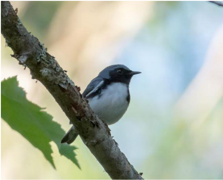
Black-throated Blue Warbler