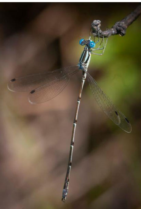
Slender Spreadwing ( Lestes rectangularis )

The Slender Spreadwing - Lestes rectangularis (Odonata: Lestidae) - is a large damselfly that until now has eluded dragonfly hunters on PEI. Spreadwings are a group of damselflies that hold their wings partly spread while at rest. The Slender Spreadwing's range is across eastern North America, ranging as far west as Manitoba and states to its south. In the Maritimes, it is found in New Brunswick and Nova Scotia – and while its presence was expected on the Island, there were no PEI records for this species until this summer.