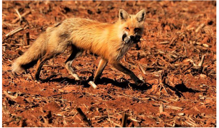
Red Fox with Prey

16(DRM);5 red Squirrels in Summerside (DRM); 4 Foxes at Borden , Sept 4(DRM) 1 Raccoon at Summerside, June 20 (DRM) Snow Shoe Hare at Bothwell, July 24(SF);