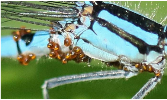
Numerous mites on a Bluet

They come by the bees honestly - Antherophagus adults feed on pollen and the larvae on organic materials and honey found in bumble bee nests.