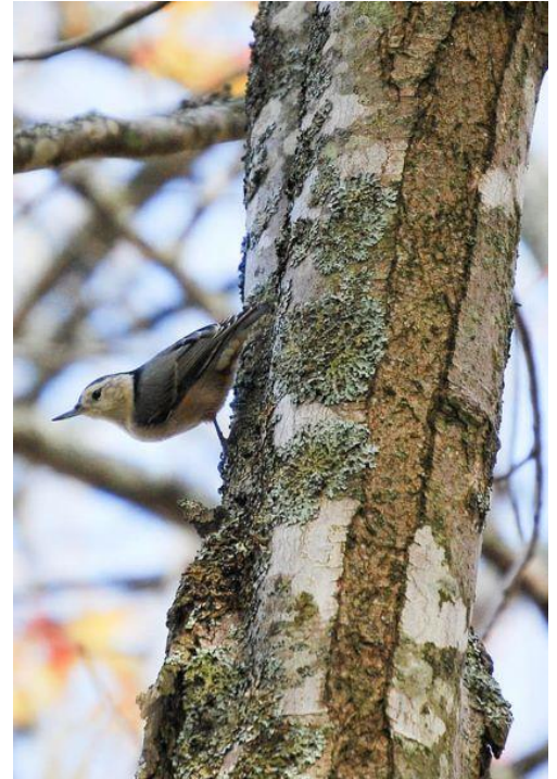
White-breasted Nuthatch