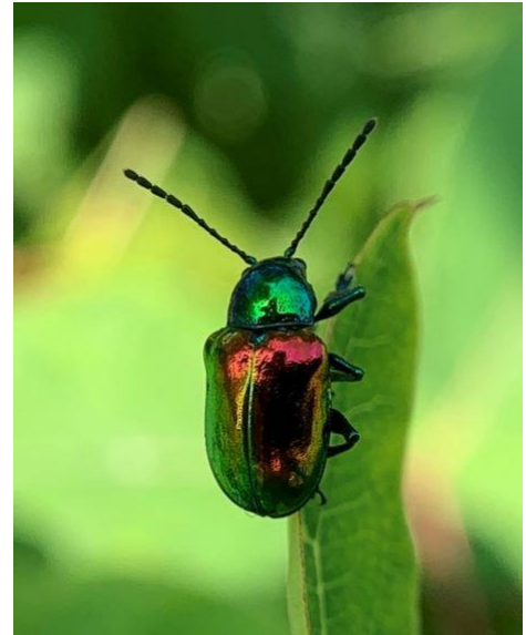
Dogbane Leaf Beetle

29(BC); Mourning Cloak Aug 28(BC); Greater