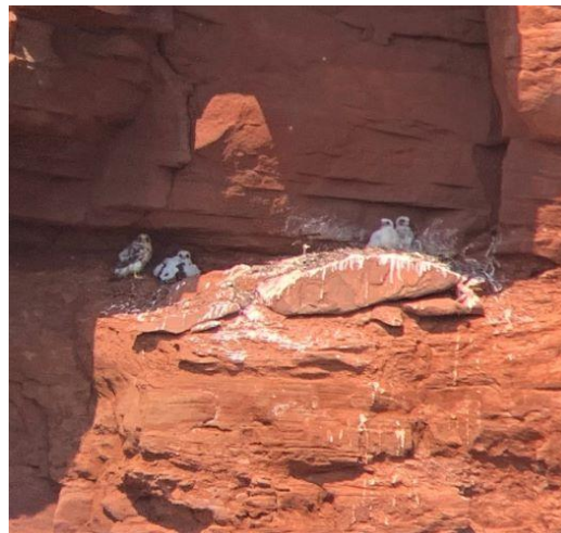
Peregrine Falcon Chicks

division was able to document a pair of Peregrine Falcons with 4 chicks. Although this species is usually seen as a spring and fall migrant, this is our first nesting record and we are very hopeful they will continue to breed on our Island.