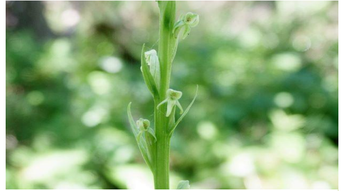
Green Bog Orchid ( Platanthera huronensis )

One of the orchids I have found is not listed in the current list of 32 species reported on PEI. This is the Green Bog Orchid ( Platanthera huronensis ) verified on Inaturalist. Sean Blaney has added it to their database as indicated below.