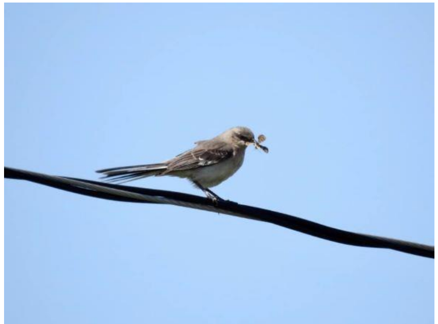
Northern Mockingbird carrying food