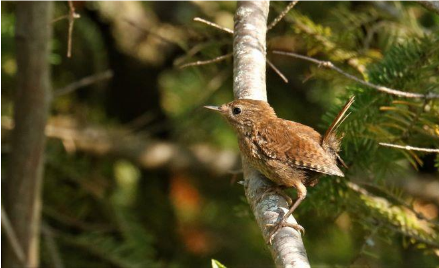
Winter Wren juvenile

July 14, (MAM); Cedar Waxwing -4 at Mckenna's Marsh, June 18, (PFfe); 2 at Cardigan, June 29, (MMD); 3 at Mckenna's Marsh June 30 (MMD); 32 at North Cape, July 14, (MAM); 14 at Crown Point, July 18, (MAM); 2 at Little River Rd, July 23, (RC); 3 at Argyle Shore, Aug 5, (RW); 2 at North Lake Harbour, Aug 8, (SCS); 3 at Rice Point, Aug 13(JML); 4 at Rice Point, Aug 13(JML); 2 at East Point, Aug 15,(KMCK); 1 at PEI NP, Aug 21, (RC); 12 at Skinner's Pond, Aug 21, (FdB); 2 at Lord's Pond, Aug 26,(DD); House Sparrow - 11 at Noonan; July 23, (DRM); American Pipit - ; Evening Grosbeak -1 at Valleyfield Rd, July 5, (WC); Pine Grosbeak - ; Purple Finch - 1 at Mckenna's Marsh June 30 (MMD); 5 at Valleyfield Rd, July 5, (WC); 2 at North Cape, July 14, (MAM); 1 at Crown Point, July 18, (MAM); Red Crossbill