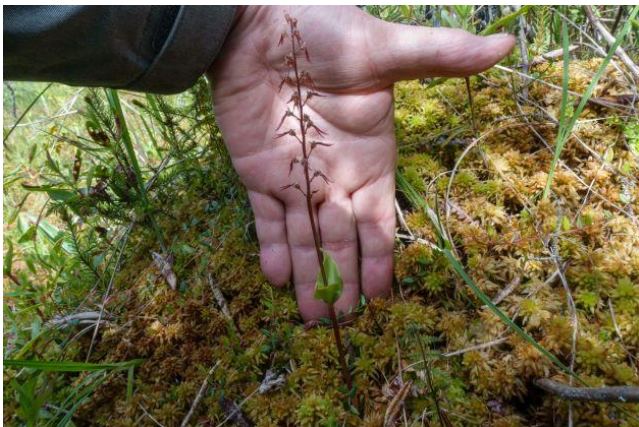
Southern Twayblade ( Neottia bifolia )

Northern Coralroot, Corallorhiza trifida